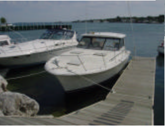
Bottom picture: "Outfoxed" 32' Trojan, stays in Straits of Mackinaw.