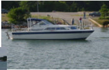
Top picture: "Abyss Diver" 29' Chris Craft, can be moved to various sites.